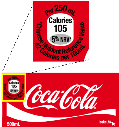
New front-of-pack label